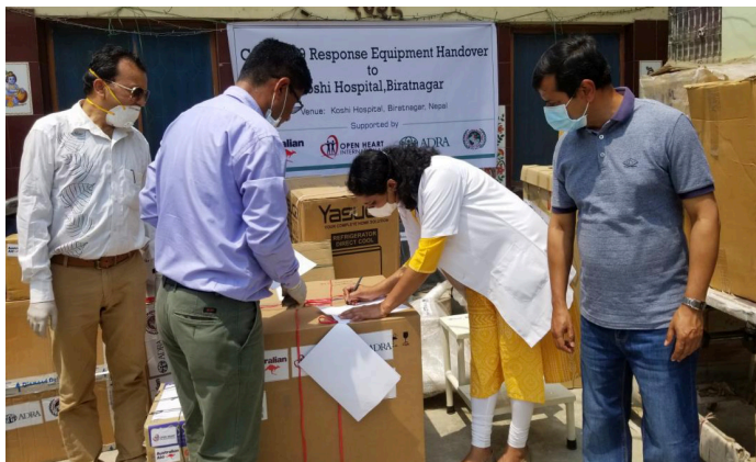
ADRA Nepal COVID-19 RESPONSE