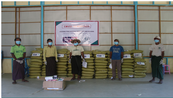
ADRA Myanmar COVID-19 RESPONSE