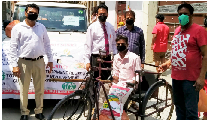
ADRA India COVID-19 RESPONSE