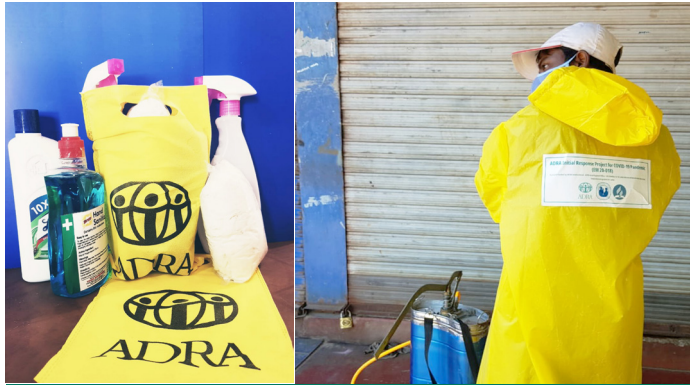
ADRA Sri Lanka COVID-19 RESPONSE