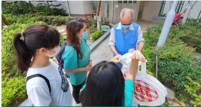
ADRA China (Hong Kong) COVID-19 RESPONSE