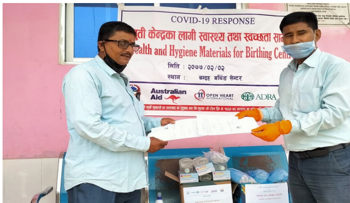
ADRA Nepal COVID-19 RESPONSE