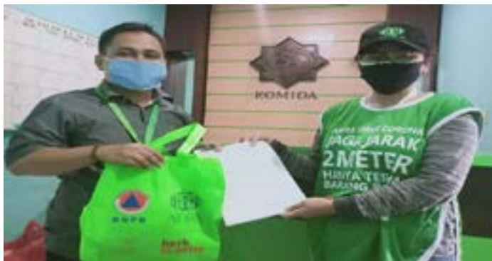
ADRA Indonesia COVID-19 RESPONSE