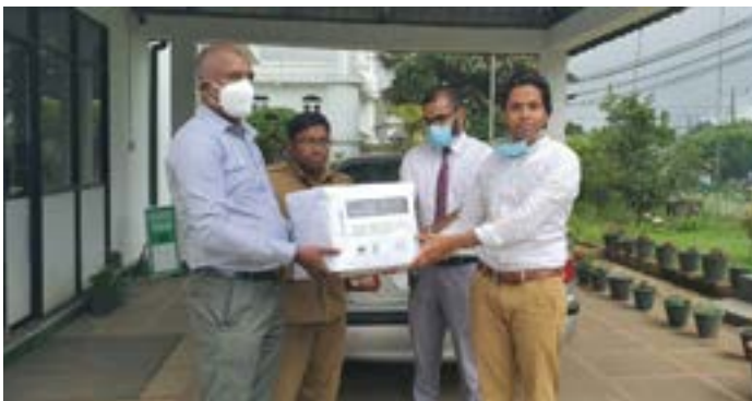
ADRA Sri Lanka COVID-19 RESPONSE