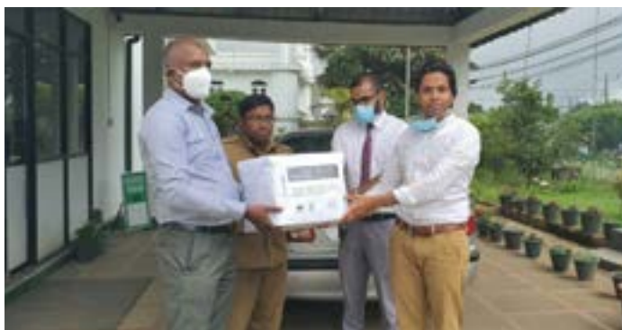
ADRA Sri Lanka COVID-19 RESPONSE