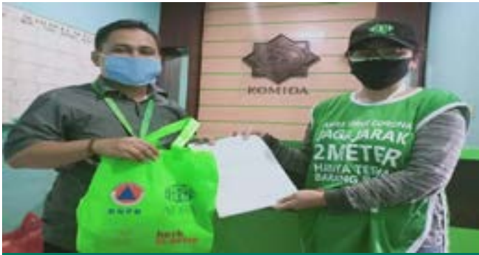
ADRA Indonesia COVID-19 RESPONSE