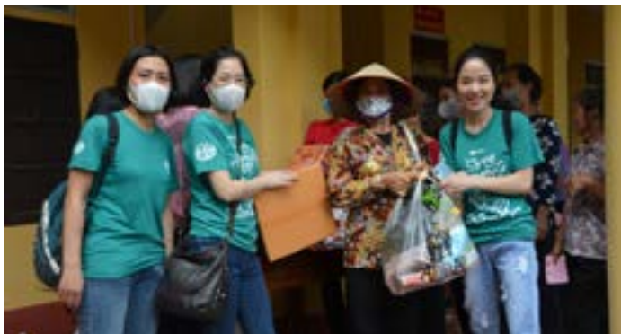
ADRA Vietnam COVID-19 RESPONSE