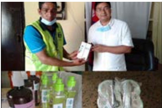
ADRA Japan COVID-19 RESPONSE