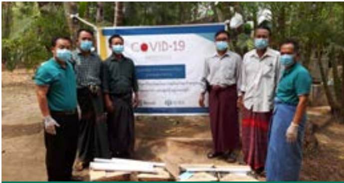
ADRA Myanmar COVID-19 RESPONSE