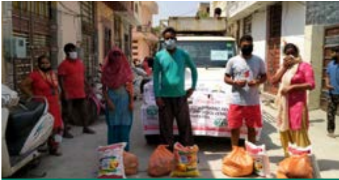
ADRA India COVID-19 RESPONSE