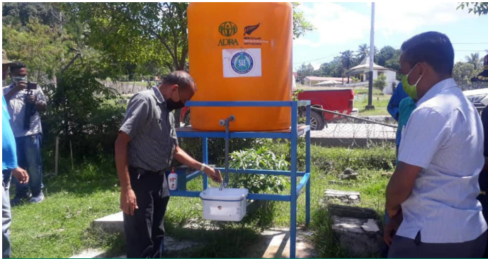
ADRA (TIMOR-LESTE) COVID-19 RESPONSE