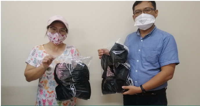
ADRA (THAILAND) COVID-19 RESPONSE