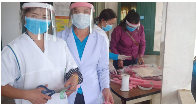
ADRA (LAOS) COVID-19 RESPONSE